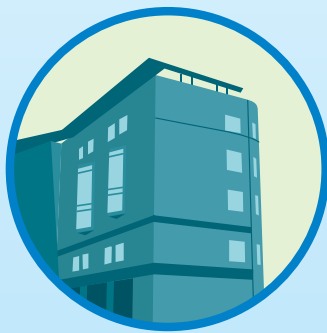
Good Samaritan Medical Center LAFAYETTE, CO