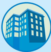
St. Vincent Healthcare BILLINGS, MT