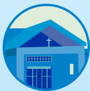
Holy Rosary Healthcare MILES CITY, MT