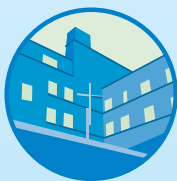
St. James Healthcare BUTTE, MT