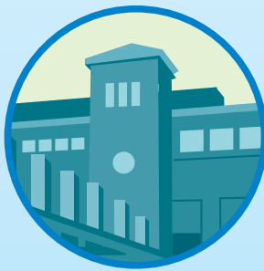
Lutheran Medical Center WHEAT RIDGE, CO