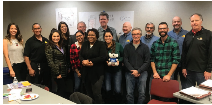
Local MHFA training

SCL Health expanded the reach of its resources even further by developing new relationships with community organizations like The Master's Apprentice – a Denver-based pre-apprentice program for individuals in the