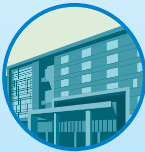
Saint Joseph Hospital DENVER, CO