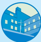
St. James Healthcare BUTTE, MT