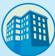
St. Vincent Healthcare BILLINGS, MT