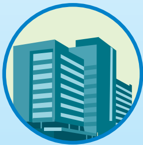
St. Mary's Medical Center GRAND JUNCTION, CO