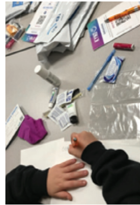
Kyndkit building at St. Vincent Healthcare Founder's Day event

As we work to maintain our physical health, we must also prioritize taking care of our mental health. St. Vincent Healthcare supports the mental well-being of families and individuals in its community. Activities in 2020 will focus on training for community members and collaborative community partnerships to provide educational opportunities and address stigma reduction.